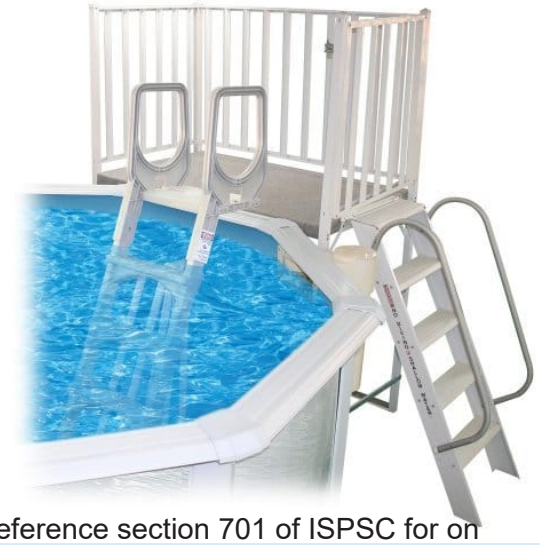
Reference section 701 of ISPSC for on ground pools

Where only the pool wall serves as the barrier, the bottom of the wall is on grade, the top of the wall is not less than 48 inches above grade entire perimeter of the pool.